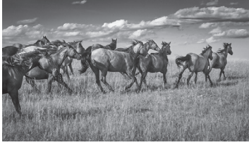
1. Dakota Mares P/P (Platinum/Palladium Print) Frame: 16 7/8" x 12 1/4" $350