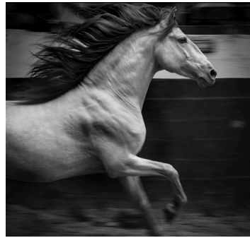
9. Fluid Geometry P/P Framed: 13 7/8" x 14 1/8" $550