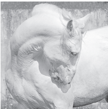
22. Alabaster Light P/P Image: 9 1/4" x 9 1/4" $350