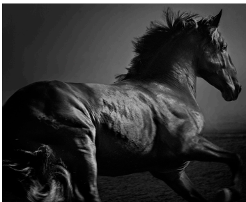
5. Strength P/P Framed: 18" x 15 1/8" $600