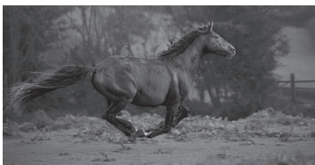
6. Outracing His Shadow P/P Framed: 21 3/4" x 15 3/8"