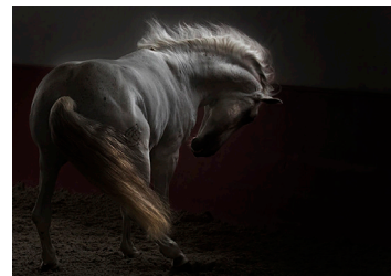
27. Carrara Muscle Giclée on Hahnemuhle Image: 27" x 19" $550