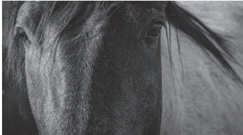
2. To Be Seen P/P Frame: 15 3/4" x 11 1/2" $400