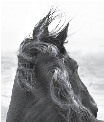
20. He Lead With His Pride P/P Image: 8 1/4" x 10 1/4" $450