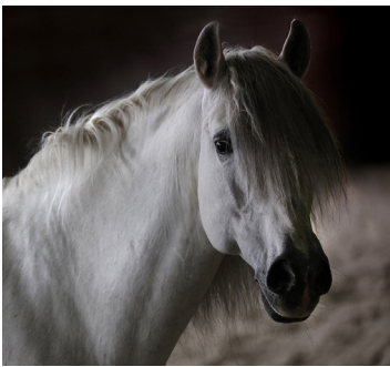
14. Alabaster Glaze Giclée on Hahnemuhle Image: 18" x 18" $500