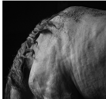
18. Falling Slowly P/P Image: 8 3/8" x 8 7/8" $300