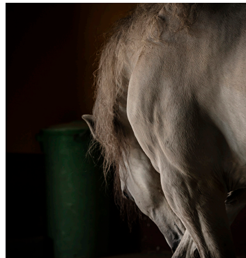
17. Green Drum Giclée on Exhibition Fiber Image: 19" x 19" $700