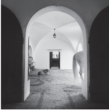
3. Stable Sage P/P Frame: 14 3/4" x 15" $450