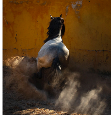
16. Yellow Dust Giclée on Exhibition Fiber Image: 19" x 19" $500