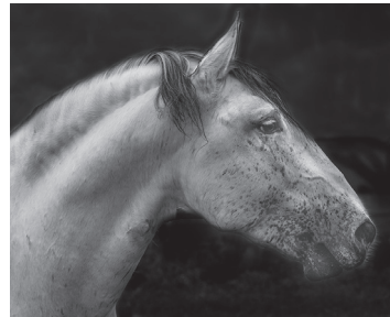
24. He Wondered Why Giclée on Exhibition Fiber Image: 22 1/3" x 18" $600