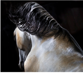
12. White Cloud Chases the Moon Giclée on Hahnemuhle Image: 22 1/2" x 18" $500