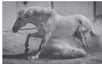
11. Dust Storm P/P Framed: 16 1/4" x 12" $450