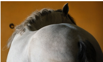
23. Yellow Wall Giclée on Hahnemuhle Image: 31 1/2" x 19" $550