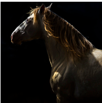
15. Cremello Views Giclée on Hahnemuhle Image: 19 1/4" x 19 1/4" $500