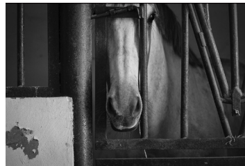
10. Waiting P/P Framed: 16 7/8" x 13 1/2" $500