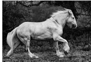
26. Shire Tale Giclée on Hahnemuhle Image: 52 1/4" x 32" $1,400