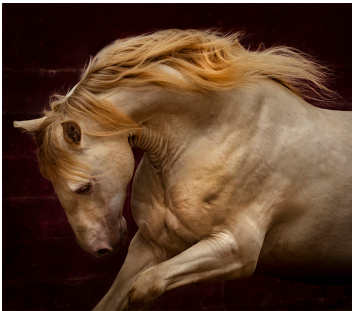
13. Red Strength Giclée on Hahnemuhle Image: 22" x 19" $500