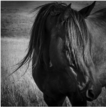
21. Wild Mare P/P Image: 9 3/16" x 9 3/16" $400