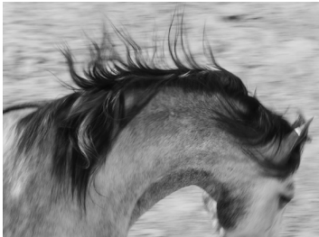
4. Soft Neck P/P Frame: 17 1/2" x 15 3/8" $500