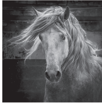
8. Wild P/P Framed: 16" x 16 1/4" $600