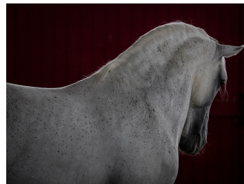
28. Garnet Grace Giclée on Hahnemuhle Image: 26 1/4" x 18" $55